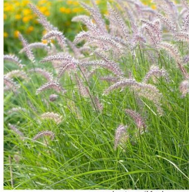
pennisetum 'Karley rose'